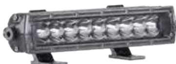
45W NIGHT STRAIGHT LIGHTBAR