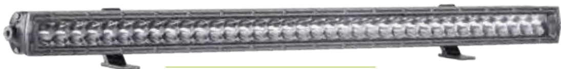
180W NIGHT STRAIGHT LIGHTBAR